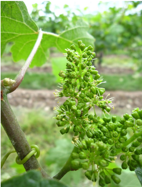
Riesling cluster in bloom.

Bloom seems to be wrapping up for most of the vinifera with maybe one or two varieties still in the later stages of flowering. This past week we had some nice warm and dry conditions, which should have helped with bloom and also can keep disease pressure low. We did see some intense localized storms move through the area this past weekend. These storms were fast moving for the most part with totals as high as an inch in some parts to less than a tenth in others.