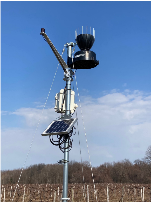
Figure 1 Brant station without the anemometer

Great news! The Brant station is back up and collecting data! It can even be found on newa.cornell.edu with actual data as of Wednesday, March 22 nd . The wind sensor was faulty and took out the rest of the sensors with it. We are currently waiting for the new anemometer to arrive, and that should be installed some time next week – shipping and weather permitting!