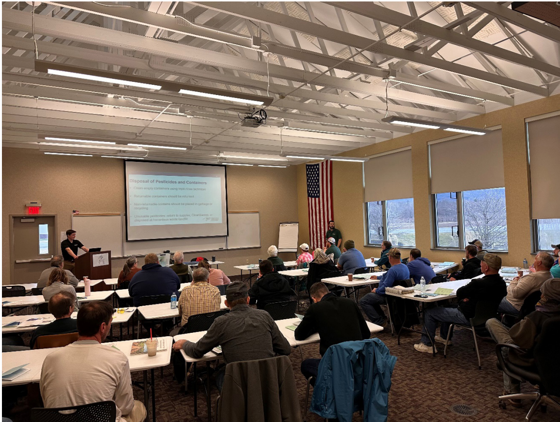
Photo 1. NYSDEC Pesticide Applicator Course

The Lake Erie Regional Grape Program worked in collaboration with New York State Department of Environmental Conservation to hold our second Pesticide Applicator Prep Course for those looking to get certified for their pesticide applicator license. The course also served as CORE credits for NYS applicators. The turnout this year was twice as large as last year and we are proud to be able to offer this opportunity to our grower stakeholders.