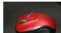
FIGURE 3 Mouse with a Scroll Button

home page. This map is scalable (you can zoom in and out) by either using the slider provided with the map (indicated by red arrow in Figure 2 , BELOW) or if you have a mouse with a scroll button (Blue arrow in Figure 3 ) it can be used to zoom in and out as well.