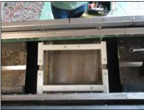
Image 1 Top Left: The weigh-frame embedded into a hole cut into the discharge conveyor belt tray. The front lip is set slightly higher than the tray so that the conveyor belt rests on the weigh-frame lip.