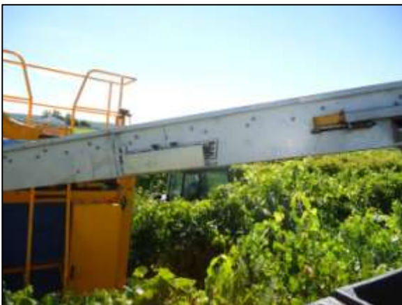
Image 3 Left: The sensor (covered by a guard) in operation.