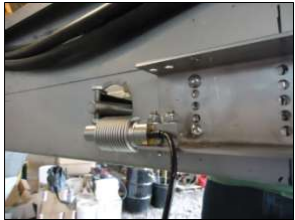
Image 2 Top Right: The externally mounted load cell sensor. The weigh frame sits on the visible cross bar transferring the load of the belt (and grapes) onto the load cell.