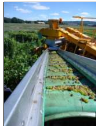
Image 4 Right: Grapes being offloaded from the discharge conveyor over the yield monitor.