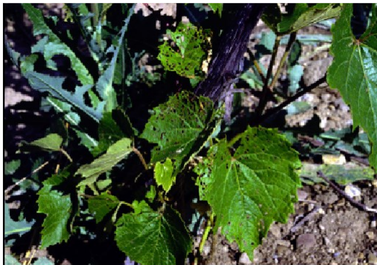
Fig. 12. Leaf feeding damage by adult grape rootworm.

There are five different insecticides labeled to control grape rootworm: Sevin, Sniper (2ee), Danitol 2.4 EC (2ee), Leverage 360 (2ee), and Admire Pro (2ee). Keep in mind your grape berry moth management strategy when choosing a material for grape rootworm. Seasonal limits should be taken into consideration so you do not find yourself without good options later in the season. Even though the adult stage does not cause significant damage to vines, it is the target of the insecticides to prevent egg laying and larval infestation. Adult female grape rootworm require a week or two of leaf feeding (pre-oviposition period) before they start to lay eggs. Hence, knowing when adults have emerged from the ground is critical to successful chemical control.