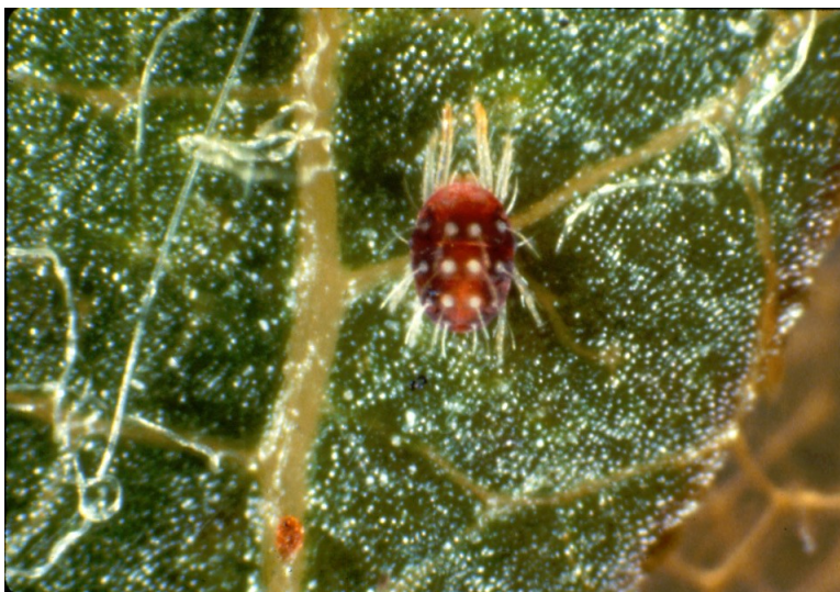
Fig. 14. Highly magnified spider mites.

Acramite includes both TSSM and ERM, although it calls for higher rates for ERM. The new label for Zeal miticide 1 includes both ERM and TSSM in NY whereas the old label only had TSSM. You need a 2(ee) recommendation, which is readily available, for use against ERM with older material. Since Zeal miticide 1 affects eggs and immatures, it is advised to apply before populations reach damaging levels to give the material time to work. Similar advice can be applied to Onager, Savey and Portal. Danitol and Brigade and Hero (two-spotted only) are broad-spectrum pyrethroid insecticides that also have fairly good miticidal activity. Pyrethroids are hard on beneficial mites, however.