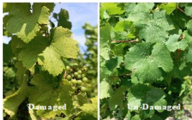
Fig. 15. Riesling leaves with and without ERM feeding damage.

There are several chemical options available for mite control in New York and Pennsylvania: Vendex [fenbutatin-oxide], Agri-Mek and several generics [abamectin], Nexter [pyridaben] (not on Long Island), Acramite [bifenazate], JMS Stylet Oil [aliphatic petroleum distillate], Zeal Miticide1 [etoxazole], Onager or Savey [hexythiazox], Danitol [fenpropathrin], Portal [fenpyroximate] and Nealta [cyfmetofen]. Read labels carefully. JMS Stylet Oil is not compatible with a number of other products including Captan, Vendex, and sulfur. Also, although Stylet Oil can help with mite problems, it is not likely to provide complete control in problem vineyards. Nexter is very effective against ERM but higher rates should be used for TSSM. It also provides some partial control of leafhoppers. Agri-Mek currently has TSSM on the label but not ERM, although in apples both species are on the label.