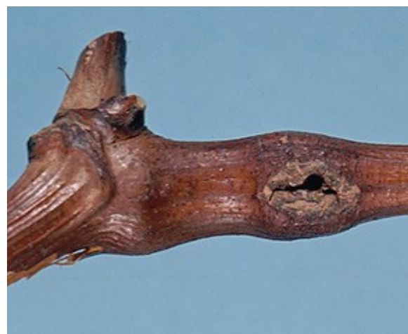
Fig. 7. Grape cane gallmaker gall, dormant season.

Insecticides for management of rose chafer listed in the 2019 New York and Pennsylvania Pest Management Guidelines for Grapes , page 87) include Assail, Danitol and Sevin.