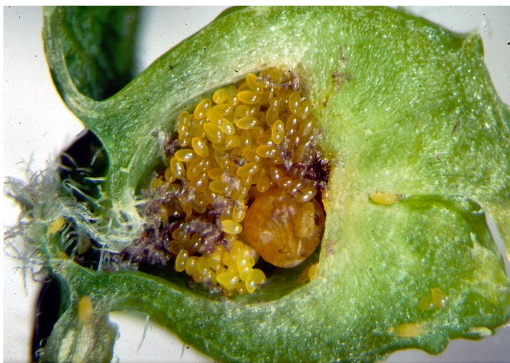
Fig. 10. A single grape phylloxera leaf gall, with the side of the gall opened to show adult female and many yellowish eggs.

Motivated by the difficulties associated with needing to hill up around grafted vines each winter to protect some buds of the scion in the case of a severe winter, we have conducted research on growing vinifera vines on their own roots. Root-form phylloxera throws a potential monkey wrench to this strategy. We have been asking, therefore, whether we can manage root-form phylloxera well enough with insecticides to allow the use of own rooted vinifera vines in some circumstances. We have been looking at this issue in two ways. One is conducting insecticide efficacy trials. To date we have found that both Movento applied to foliage and the insecticide Admire Pro applied through a drip system or as a drench have been fairly effective in reducing galling on the roots of V. vinifera and Concord vines. Our second approach has been to study the potential of growing own-rooted vinifera (hence, not necessary to hill up) by using insecticides (Admire Pro) to mitigate negative effects of root form phylloxera. We now have several years' worth of data. Own-rooted vines when treated with insecticide had at least as much live periderm at the end of the five-