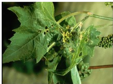
Fig. 4. Grape plume moth.

This is another potential pest of grapes that overwinters as eggs in canes and emerges shortly after budbreak. Larvae typically web together young leaves or shoot tips and leaves to form a protective chamber from which they feed (Fig. 4). Research indicates 1) that damage tends to be concentrated on the vineyard