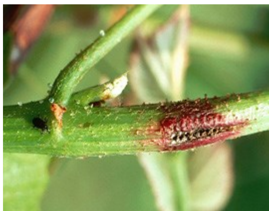
Fig. 6. Grape cane gallmaker gall in season.

Adult beetles are about ½ inch long, have a light brown-tan body coloration and long, spiny legs. Females prefer laying eggs in grassy areas with sandy soils. Rose chafer grubs are C-shaped and have a white body with a brown head capsule. They are similar in appearance to Japanese beetle grubs. These