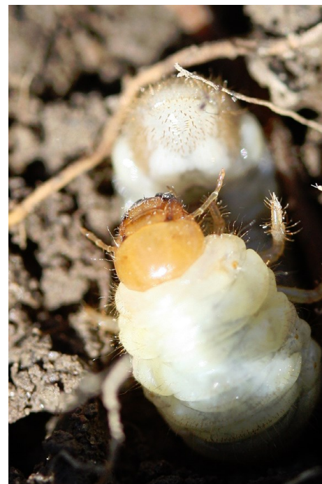
Fig. 17. Mature Japanese beetle larva (grub).

There are several insecticides labeled for use against Japanese beetles on grapevines. These all are roughly similar in efficacy