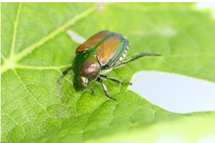
Fig. 16. Japanese beetle.

The adults emerge from the soil in mid-summer and begin feeding and then mating and egg-laying. The feeding damage caused by adults can be quite extensive, perhaps exceeding 10 or 20% of the foliage. Fortunately, grapes are fairly tolerant of this type of feeding at this time of the season. The exact amount is hard to nail down but it seems that up to 15 or 20% leaf damage has little impact. Note, though, that the actual impact of leaf feeding will depend on a number of factors including health and size of the vine and the cultivar. Moreover, if it is a high value cultivar then the economic injury level will be lower compared to a lower value cultivar. Young vines may be particularly vulnerable in