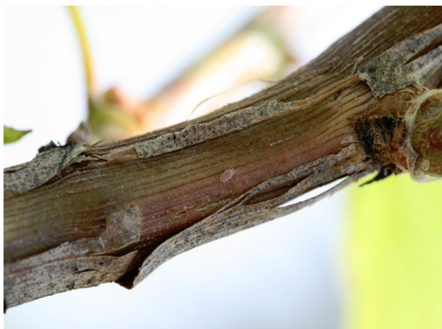
Fig. 1. Grape mealybug.