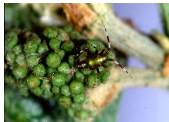
Fig. 3. Banded grape bug.

edge near woods and 2) that it takes quite a few plume moth larvae to cause economic damage. For Niagara grapes we were unable to detect a statistical effect on vines with 20% infested shoots compared to control vines. Nevertheless, the trend was for reduced yield associated with high plume moth infestations (>20%). For higher value cultivars a somewhat lower threshold would be appropriate. Treatment of plume moth can be tricky for several reasons. First, the larvae develop very quickly and often have reached the pupal stage before you even recognize there is a problem. Second, larvae inside their leaf shelters are protected from insecticides. For these reasons, it's important to monitor and treat for plume moth early in the season (before 10 inch shoot stage) using sufficient water to achieve good coverage. Danitol is the only insecticide labeled for use against grape plume moth in NY (2(ee) recommendation). Dipel can be used in PA, as well as, some other insecticides labeled for use on grapes.