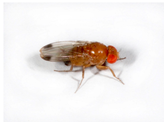
Fig. 18. Adult male SWD.

Drosophila fruit flies are susceptible to a number of different insecticides including organophosphates (e.g. malathion), pyrethroids (e.g. Mustang Max [zeta-cypermethrin]) and spinosad type insecticides (e.g. Delegate [spinetoram] or an organic alternative, Entrust [spinosad]). Since fruit flies are only a threat near harvest, insecticides with relatively short DTH restrictions, such as Mustang Maxx with a one DTH, are the most helpful. In our initial studies we applied insecticide starting about when grapes reached 15 brix and continued weekly applications thereafter leading up to harvest. However, more research is necessary to better determine optimal timing and frequency of insecticides. Check the grape pest management guidelines for more specific details. You can also find more information about spotted wing drosophila at http://www.fruit.cornell.edu/spottedwing/ .