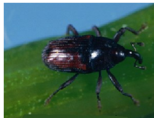
Fig. 5. Adult grape cane Gallmaker.

Rose chafer is a beetle in the same Family (Scarabaeidae) as the Japanese Beetle. Rose chafer adults feed on a variety of host plants (e.g., roses, tree fruit, small fruit, etc.) but in our area the preferred host is grape. Although rose chafers are not a widespread problem, in a majority of vineyards across the Lake Erie Region, these beetles can cause significant crop loss in vineyard blocks where they occur. Vineyard blocks with sandy soils (particularly sandy sites from the lake front to just south of Route 5 in North East, Pennsylvania) have the most persistent problem with this pest. I have also seen spotty problems on sandy knolls in some blocks in the grape belt. Every year in early June (about 7-10 days before bloom) in the Lake Erie Region, large numbers of rose chafer beetles emerge from the soil at the same time and begin mating and feeding extensively on tender flower clusters. Beetles will also feed on grape leaves but over the years I have only seen minimal injury on Concord leaves. Feeding continues to occur in vineyards for about a 3 week period. Fortunately, there is only 1 generation per year.