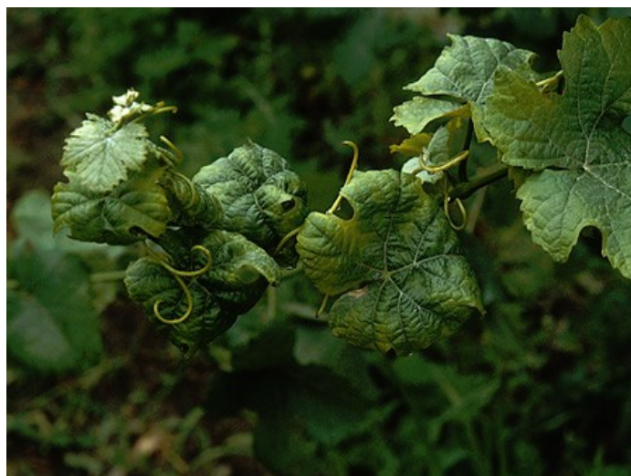
Fig. 9. Distorted leaf and shoot development caused by Potato leafhopper feeding.

Potato leafhopper is a sporadic pest, although it can be serious in some places and some years. We currently do not have good estimates for an economic threshold. We do know that shoots will recover from feeding damage once the leafhoppers are removed. Several insecticides are registered for its control in grapes including Sevin, Danitol, Leverage, Assail, Admire Pro, Actara (not for use on Long Island), and Applaud (not for use on Long Island). Note that products containing imidacloprid are considered restricted use pesticides in NY (not PA). Potato leafhopper is fairly mobile and it may require several treatments over the season as new infestations occur.