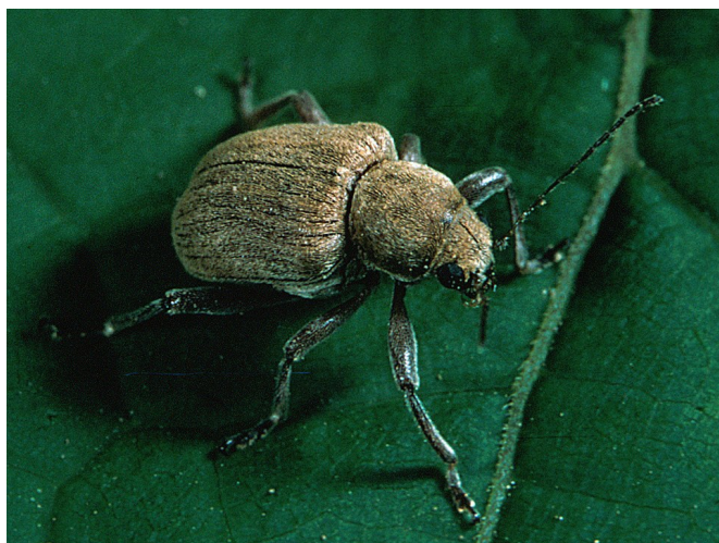
Fig. 11. Grape rootworm

Tim Weigle, NYS IPM Program, studied the emergence patterns and control of grape rootworm in the Lake Erie region and his research indicates that adults begin appearing around or shortly after bloom (about 600 degree days, base 50 F) and peak around third week of June (around 750 DD) (see Figure 13, 2015 data). It has been found that if you can easily find feeding damage in a vineyard the optimum timing for management has passed. Scouting for