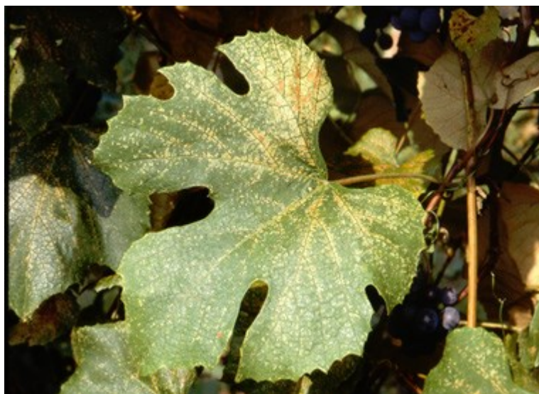
Fig. 8. Grape leaf with Grape leafhopper feeding damage.

Sampling for leafhoppers corresponds to sampling for grape berry moth. At the immediate post bloom period sucker shoots should be examined for evidence of stippling (white dots on leaves caused by leafhopper feeding). If you see stippling throughout the vineyard block an insecticide treatment is recommended. Note that for vineyards at high risk of GBM damage, you may already be applying an insecticide at this time (10 day postbloom). If you use a broad-spectrum material such as Danitol you will also control leafhoppers. The next sampling period for leafhoppers is mid July and focuses on abundance of first generation nymphs. Check leaves at the basal part of shoots (leaves 3 through 7) for leafhopper nymphs or damage, on multiple shoots and multiple vines located in the exterior and interior of the vineyard. Use a threshold of 5 nymphs per leaf. The third time for sampling for leafhoppers should occur in late August. This focuses on nymphs of the second generation. Follow a similar