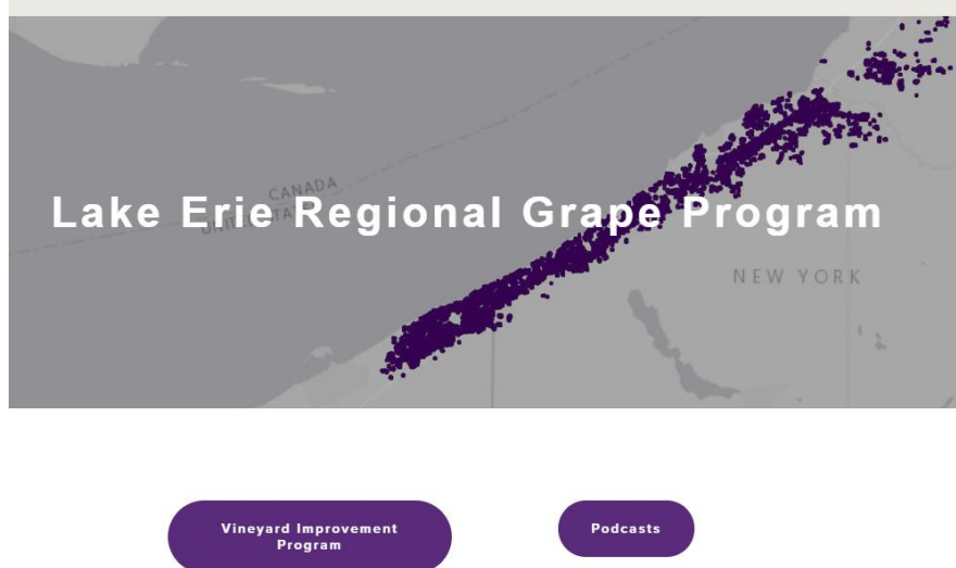
Figure 1: LERGP.com homepage with quick access to vineyard improvement program information.

You can apply for the Vineyard Improvement Program (VIP) at https://lergp.com/vip-application/ . LERGP.com also has more information about the program. Frequently asked questions, eligibility requirements, sample budgets and business plans are all available.