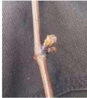
Image 1. Dead bud – The outside of the buds are brown and “crunchy” to the touch & clearly dehydrated.

Here are a few images: