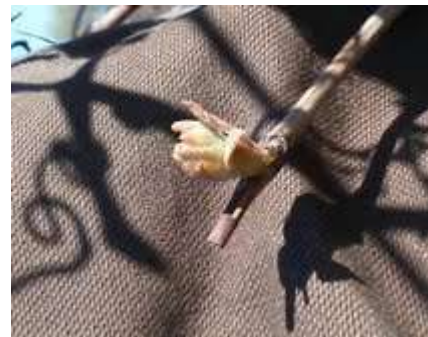
Image 4. Live bud. Outer tissues/leaves are green with minimal browning on edges.