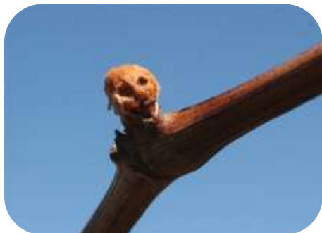
Flea beetle damage

These damage ratings are to be used only as a guide to give you an idea of what might be happening in your area. The only way to determine what is the actual amount of damage is in your vineyards is to get out and take a look. With the numerous freeze events we have/are experiencing this spring it would be worth the time to get out and see where you stand in the way of healthy buds. This will provide you with important information that you can use in determining whether your vineyard IPM strategy needs to be adjusted for the coming growing season.