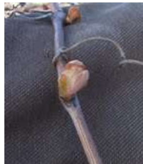
Image 3. “Iffy” or “watch list” – some pink showing with some browning on the outer edges. Cutting into this bud reveals green tissue with possibly additional brown edges.