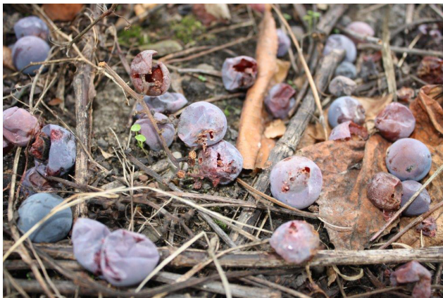
Shelled berries with GBM injury (left)