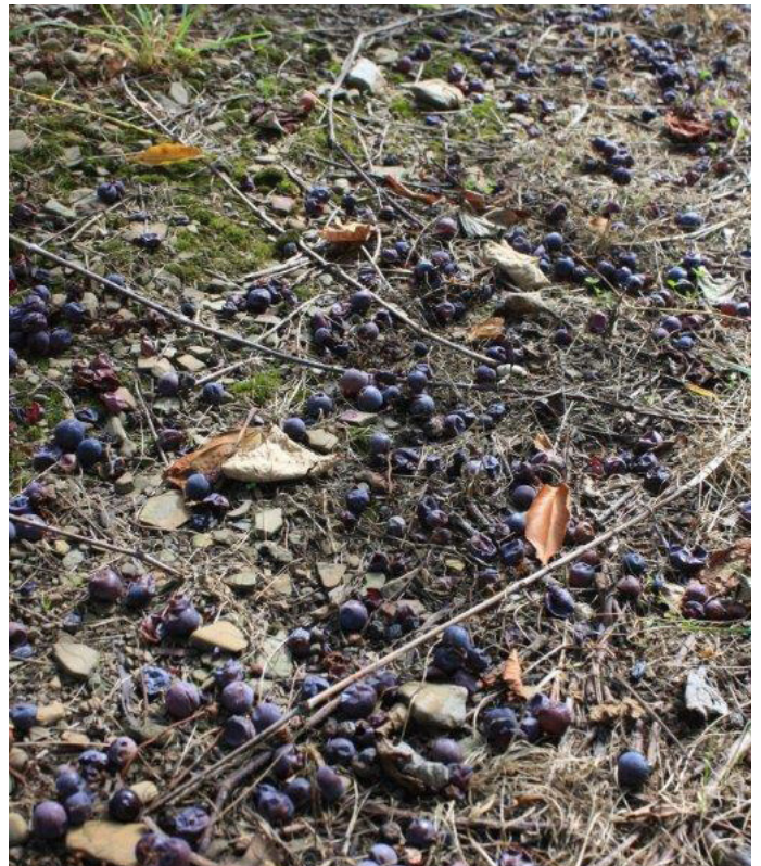
Shelling caused by GBM injury (right)