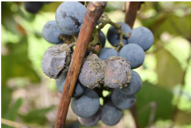
Botrytis on Concord berries with GBM injury (left)