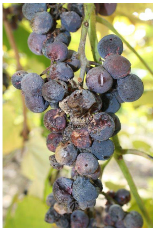
GBM infested Concord cluster (right)