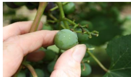
Four GBM eggs (unhatched & hatched) on Concord berry