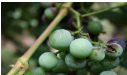
GBM eggs and injured berries on Concord cluster