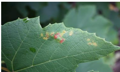
Active, yellow downy mildew lesions and older, brown lesions on Niagara leaf

Remember that DM can quickly become rampant under the right environmental conditions causing premature defoliation. Any blocks with susceptible varieties should be checked for increases in leaf infections. Keep monitoring these sites for the remainder of the season to determine if a fungicide application will be needed.