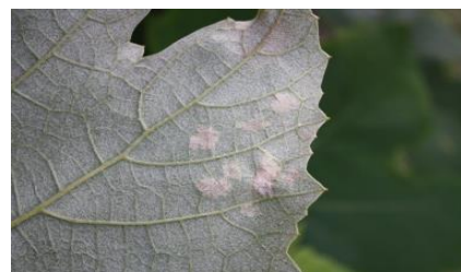
Underside of Niagara leaf with downy mildew sporulation