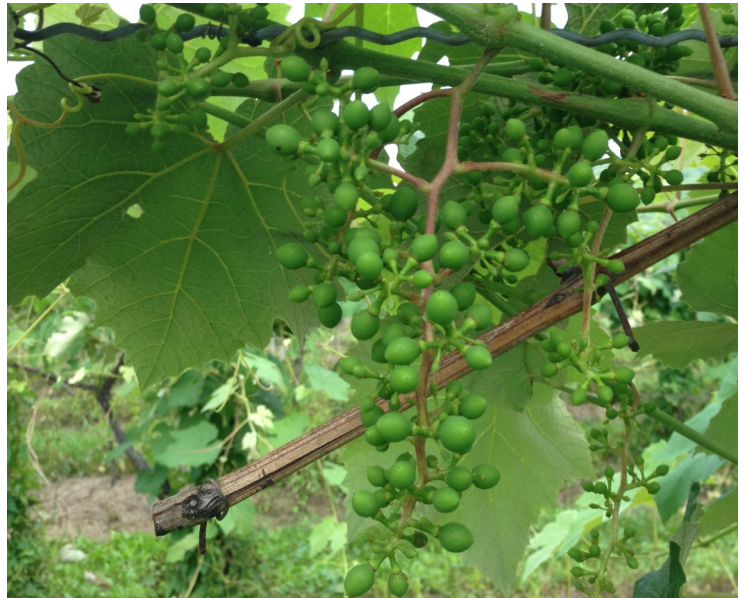
Niagara cluster at E-L stage 29 (BB-sized berries)

We have not seen many vines starting to collapse yet from trunk injury. As the season progresses and the vines get added stress on them from ripening a crop we might see some start to collapse. We are seeing lots of suckers pushing and if you are looking to retain them as renewals for next year it is a good idea to get them tied up now. For the past couple weeks if you tried to lift them up they may have broken off however after bloom they seem to get stronger and respond better to being tied up. For vines that don't have a lot of shoot growth it will be important to retain all the suckers you can to help slow down vine growth. Thinning to just 2 or 3 suckers will force those left to grow extremely vigorously and be almost useless next year. I know that bunching up all of that foliage will be a pain to spray but good coverage and penetration is important to keep those shoots healthy and disease free.