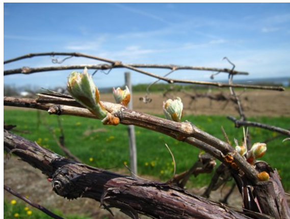
Riesling (left) and Elvira (right) buds finally emerging on May 13, 2014.