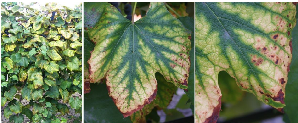
Magnesium deficiency in Concord

This is a great time of year to look for nutrient deficiencies and foliar disorders in the vineyard. Now that harvest is moving into full swing you have a chance to get a good look at your entire vineyard as you harvest. Potassium and magnesium are two of the more noticeable deficiencies found on leaf. Magnesium deficiency show chlorosis or yellowing in leaf while the area close to the main veins stays green (Picture 1). Magnesium deficiency most often occurs in soils that have a pH below 5.5 where potassium becomes more available.