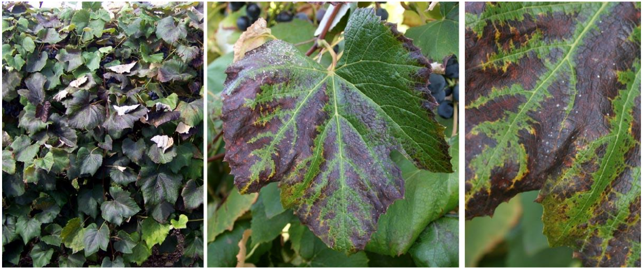
Potassium deficiency in Concord

Other nutrient deficiencies and or foliar to be on the lookout for are nitrogen deficiency and nitrogen spray burn, acidic soil damage, iron deficiency, crown gall, spray damage, and symptoms of drought. If you see symptoms and would like soil or petiole samples taken, bring samples into the Cornell Lake Erie Research and Extension Laboratory (CLEREL) at 6592 West Main Road Portland, NY 14769. The cost per sample is $30.00 for petiole sample (bring in 50 petioles) and $17.00 for soil samples.