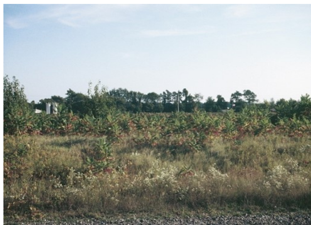
Figure 2. Overgrown areas around the vineyard can be overwintering sites for grape berry moth pupae.