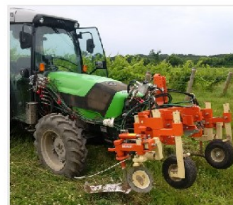
BRAUN Grape Hoe