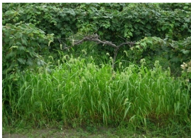
Figure 1. Weeds under the trellis can harbor grape berry moth pupae.

Vineyard area maintenance such as preventing overgrown, trashy areas around the vineyard will reduce overwintering sites for GBM pupae ( Figure 2 ). If possible, removal of wild grapevines near the vineyard will decrease potential reservoir sites ( Figure 3 ).