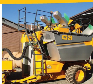
2015 GREGOIRE G3 Low Hour Unit - New Warranty. Side Discharge / 1400L Stainless Reserve Hopper, Drive Wheels with Steering Correction, 25% Slope Correction, Low Compaction Tires $145,000 USD