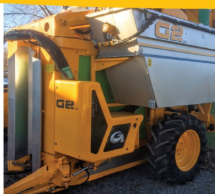
2012 GREGOIRE G2.220 Low hour trade with on-board Cleantech Vario sorting (removes 98.5% of MOG), Twin Bin, Auto Steer, Field Ready $100,000 USD WITH WARRANTY