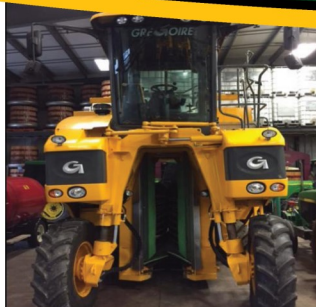
2013 GREGOIRE G8 Cleantech Vario on-board Sorting System, 500 hours, Twin 1600L Stainless Bins, 28% Slope Correction, Comfort Cab. Sold with NEW warranty! $250,000 USD

NEW AND USED GRAPE HARVESTERS, WIND MACHINES, LEAF REMOVERS, VINEYARD SPRAYERS, TRIMMERS, SHREDDERS, AND PRE-PRUNERS. VISIT OUR WEBSITE TO SEE OUR CURRENT INVENTORY