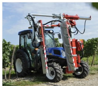
ERO Leaf Cutter