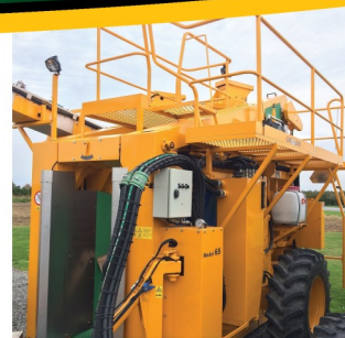
2012 GREGOIRE G65 ONLY 50 HOURS! Sold as New with Warranty, Double Drop Cross Conveyor, Rear Controls, Upper Walkway. $99,000 USD

TEL: 905.646.8085 | TF: 1.866.677.4717 | lakeviewvineyardequipment.com 40 Lakeshore Road, R.R. #5 | Niagara-on-the-Lake, ON | L0S 1J0