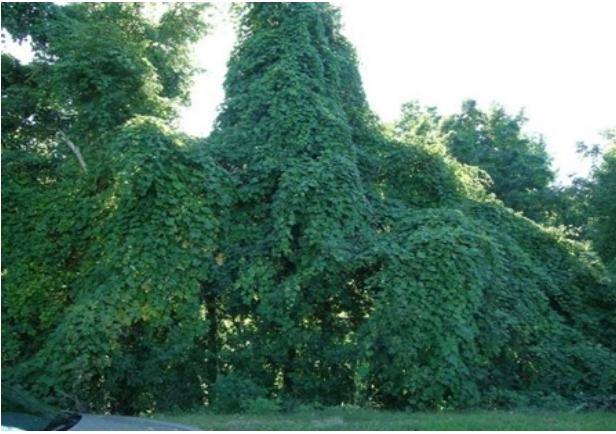
Figure 3. Wild grapevines near the vineyard are potential reservoir sites for grape berry moth.