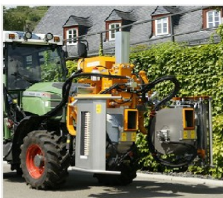
BINGER Leaf Remover