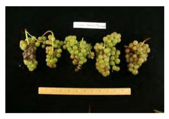
Source: "Vignoles Harvest: Shoot Thinning, Training System and Botrytis" by Tim Martinson.

http://www.fruit.cornell.edu/shared/pdfs/Vignoles.pdf