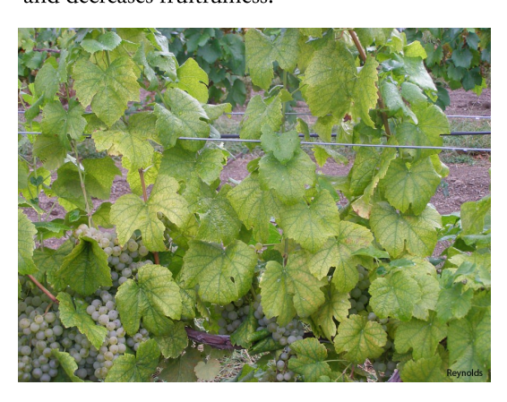
Figure 1 A nitrogen deficient canopy.

a problem. Applying nitrogen when it is not needed can do more harm than just wasting money. Excessive nitrogen coupled with an adequate amount of soil moisture can produce can produce extremely vigorous vines with long shoots, many laterals, and poor wood maturation. Excess vegetation can decrease airflow thus increasing the disease potential. Try to avoid applying nitrogen immediate before or during bloom since this can decrease fruit set by shifting a vines focus to vegetative growth. A decrease in yield can also be associated with excessive nitrogen application when the canopy shades buds the buds for next year and decreases fruitfulness.